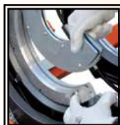
Inserts Ø 75 ÷ 225 mm