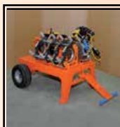
Trolley for machine body