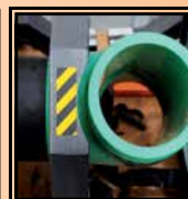
Top Clamp Short Elbows/Tee