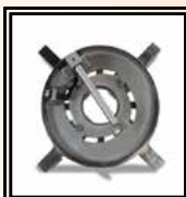
Tool for flange necks