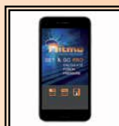
App "Set & Go Pro"