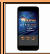
App "Set & Go Pro"