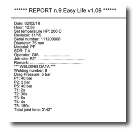
Report by EASY LIFE