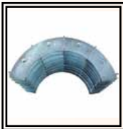
Inserts Ø 200 ÷ 450 mm