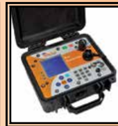
The INSPECTOR Data-logging