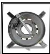
Tool for flange necks