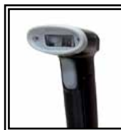
Bar code reader