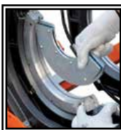
Inserts smartlock \varnothing 75 \div 225 mm \varnothing 90 \div 280 mm