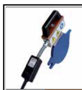
Heating plate with Digital Dragon