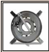
Tool for flange necks