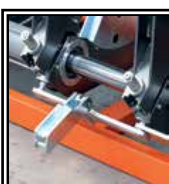
Detach device for heater