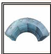
Inserts Ø 63 ÷ 180 mm